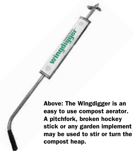
Above: The Wingdigger is an easy to use compost aerator. A pitchfork, broken hockey stick or any garden implement may be used to stir or turn the compost heap.