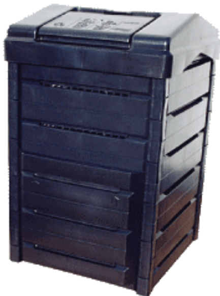
Garden Gourmet Composter – commercially available compost bin made from 100% recycled plastic. These bins are available year-round at the Green Calgary Store.

The correct decision as to what composter to build or buy will depend upon a careful consideration of a number of factors such as the amount of material to be composted, the amount of room available, the cost, its appearance and the amount of time and labour will be devoted to operating it. Home composters can be made of various combinations of wood, plastic, and metal.