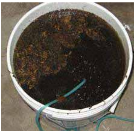
The compost tea set up.

Note: aeration equipment is important to avoid the organisms from using up all of the oxygen and creating an anaerobic soup. Anaerobic tea may harm your plants. The tea must brew for two or three days and then used immediately. Rainwater is also best for the compost tea process.