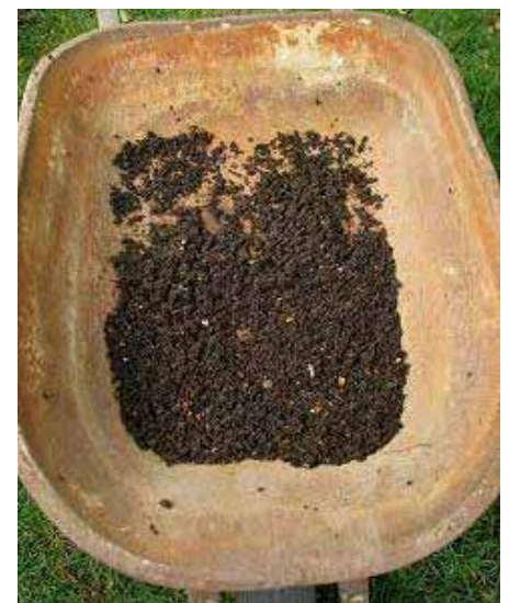
Finished, screened compost. Ready for mulching or digging into the garden.

For home composting purposes, compost may be assumed to be fully “finished” when a number of indicators are obtained. Stable compost has been described as dark brown or greyish black in colour, with a sweet, earthy smell and a loose, crumbly texture that feels and looks like topsoil. Some large pieces remain but everything’s a relatively uniform dark brown/grey colour. The centre of the pile is no longer hot, and if you turn the pile it no longer heats up.