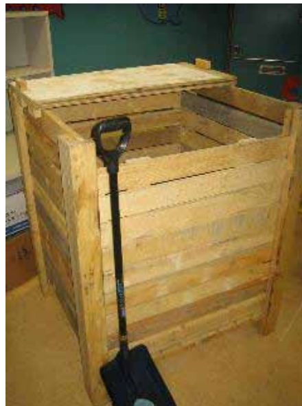
A homemade bin made from wood from used wooden pallets.